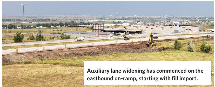
Auxiliary lane widening has commenced on the eastbound on-ramp, starting with fill import.

Work on the retaining walls below the LaCrosse Street bridge will continue. Once the Maple Avenue bridge deck widening is complete, concrete will be poured to connect the new bridge deck with the auxiliary lanes on the I-90.