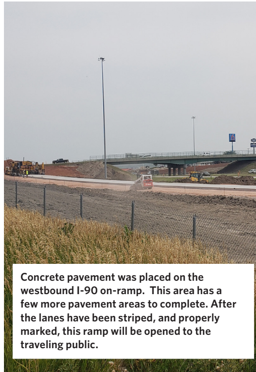
Concrete pavement was placed on the westbound I-90 on-ramp. This area has a few more pavement areas to complete. After the lanes have been striped, and properly marked, this ramp will be opened to the traveling public.