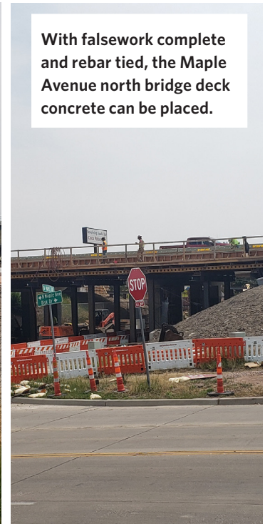
With falsework complete and rebar tied, the Maple Avenue north bridge deck concrete can be placed.